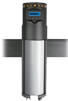
8 Lb. Cartridge