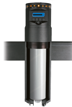
2 Kg. Cartridge